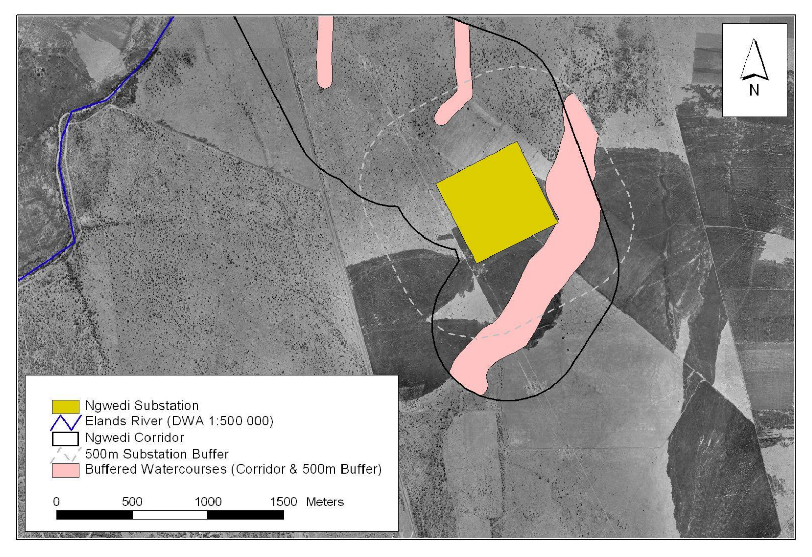
Figure 3: Buffered watercourses around the Ngwedi Substation and the south-eastern portion of the Ngwedi Corridor (associated with a separate transmission line project), and a 500 m buffer around the substation.