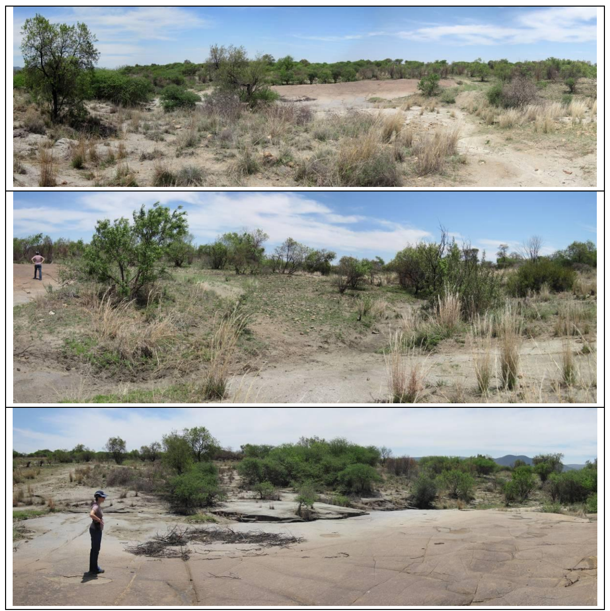
Figure 4: Illustrates a range of photos of well developed riparian habitat associated with a bedrock channel in the downstream half of the delineated watercourse located southeast of the Ngwedi Substation.