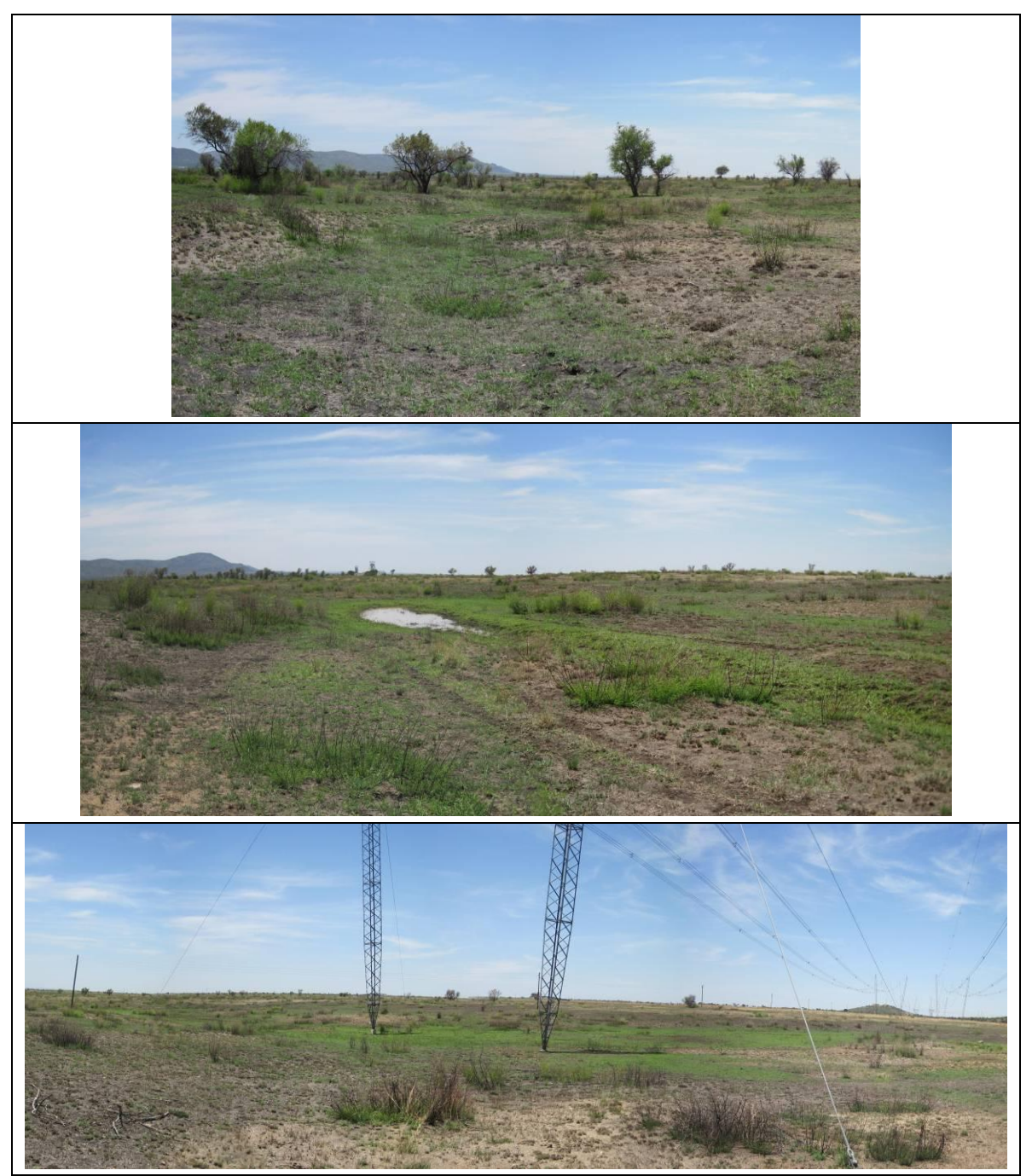
Figure 5: Illustrates indistinct riparian habitat in the upstream half of the delineated watercourse located south of the Ngwedi Substation. This includes the absence of well developed channel features and obligated hydrophytes (top, center and bottom), temporary surface ponding (center), and the presence of an existing pylon within the watercourse (bottom).